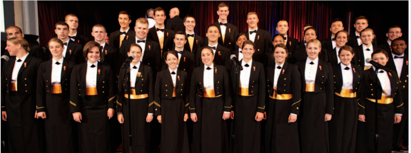
NEW YORK, OCTOBER: The Coast Guard Academy Glee Club at the 31st Annual Salute to the United States Coast Guard in October, 2011.