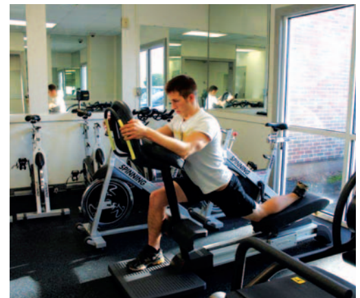
In Yorktown, Virginia, active duty personnel stay fit on equipment provided by the Coast Guard Foundation.