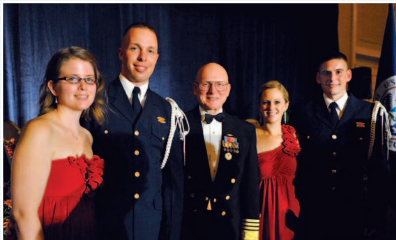
The Commandant with young Coast Guardsmen and their dates at the 2011 Commandant's Ball.