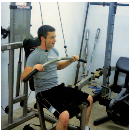
The crew at Sector Houston-Galveston get a lot of use out of the Bow Flex workout machine the Coast Guard Foundation purchased for them.

Shipmate Fund grant, the unit purchased a Bowflex Revolution Home Gym and Dumbbell Set. “The new equipment has impacted the crew in a positive way from the moment it was assembled. The Bowflex Revolution Home Gym provides a great variety of workout options and is compact enough to fit into a small space,” the OIC wrote.