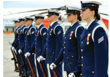
Coast Guard members stand at attention at the memorial ceremony for the fallen crew of CG-6535 at Air Training Center Mobile in 2012.

Sadly, since 2008, the Coast Guard community has lost four aircrews in mission-related crashes. Each time, the Coast Guard Aviation Association has generously answered the call to support their fallen comrades by donating to the Coast Guard Foundation's Family Disaster Relief and Fallen Heroes Scholarship funds.