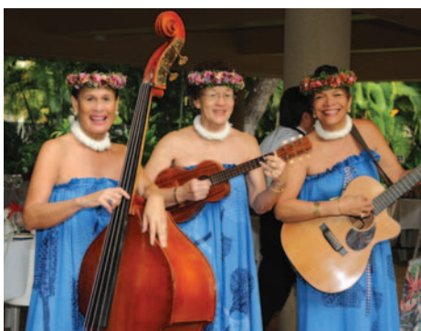
Native Hawaiian band at the dinner in Honolulu.

Our event program is an important avenue for shining a light on the great work the men and women of the Coast Guard do on a daily basis. We host eight high-profile awards dinners held around the country, from Hawaii to New York City, that honor heroic efforts by Coast Guard personnel.