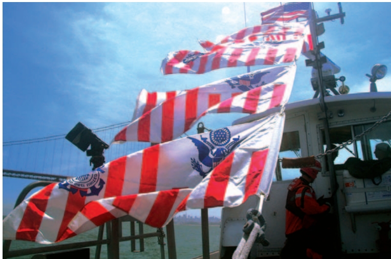
A crew from Air Station San Francisco hoists four ensigns to honor the crew of CG-6505, from Station Barbers Point, who perished in 2008.