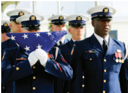
The Coast Guard Ceremonial Honor Guard presents the national ensign at the memorial for CG-1705, from Air Station Sacramento, in 2009.

“The special bond emanates from our flying as a team... everyone has a position and duties, and it takes all of us to make the mission successful.”