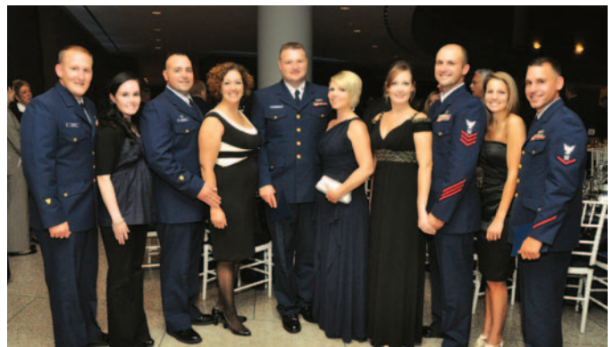
BOSTON, SEPTEMBER: The First District Awardees with their spouses at the Boston Awards Dinner, held in September, 2011.