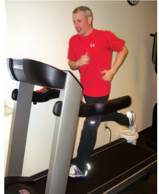
A Coast Guard member at Station Manistee, Michigan puts some miles on the Foundation-provided treadmill.

“The crew has already started using the treadmill in a unit running challenge. The crew has covered over eight hundred miles in the last two months. We may have to purchase another one if this enthusiasm continues,” the officer in charge wrote in a thank you letter to the Foundation.