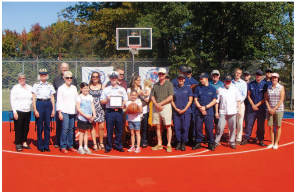
The Coast Guard Foundation built a $15,000 basketball court at Station Thomas Point, Maryland so the crew and families stationed there would have a safe place to play and enjoy outdoor fitness activities.

Supporting margin-of-excellence programs that benefit the men and women on the front lines of the Coast Guard helps ensure these dedicated individuals have opportunities for education, health and wellness activities off duty, so they can excel on duty.