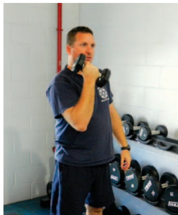
The Foundation funded a complete set of free weights for the Atlantic Strike Team unit based in New Jersey.