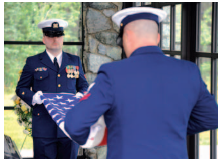
Coast Guard petty officers fold the American flag at the funeral in Anchorage of a crewmember of CG-6017, from Air Station Sitka, in 2010.