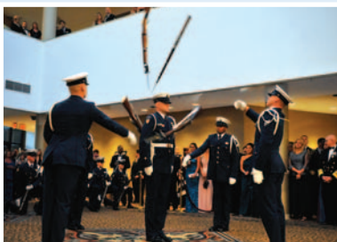
The Silent Drill Team in action at the ball.