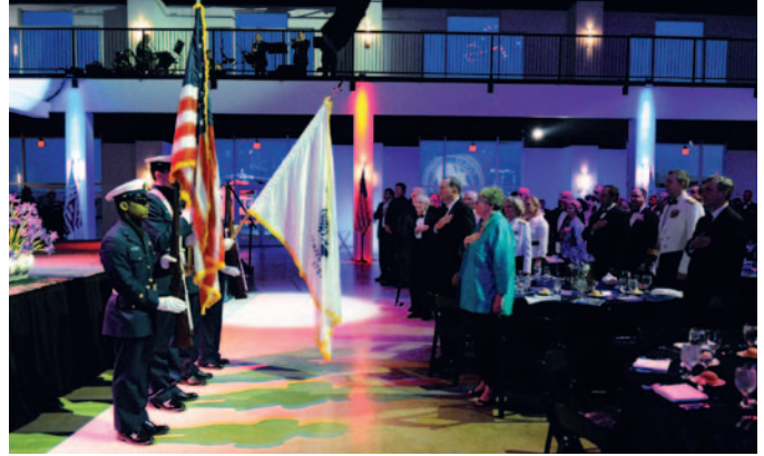
NEW ORLEANS, APRIL: The Coast Guard Color Guard presents the ensigns at the Guardian of the Heartland Dinner in New Orleans in April, 2011.