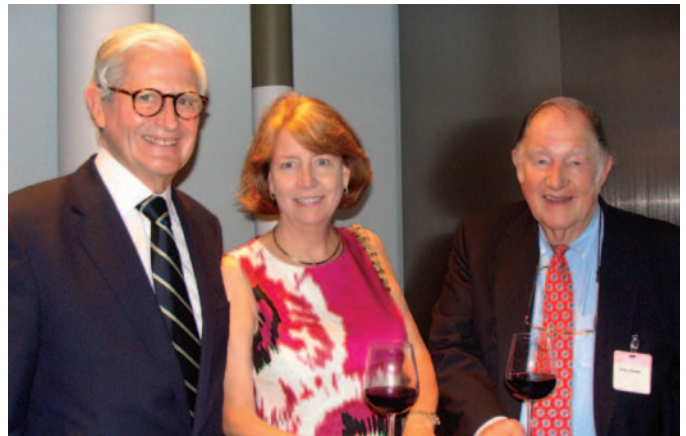
WASHINGTON, D.C., JUNE: